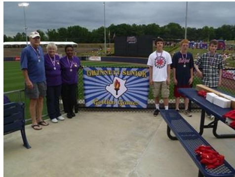
Demo at Gwinnett Braves May 8