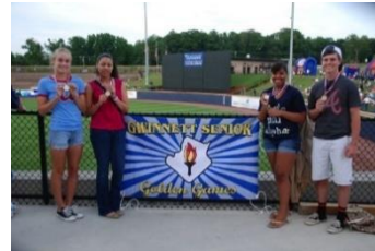
Demo at Gwinnett Braves May 11