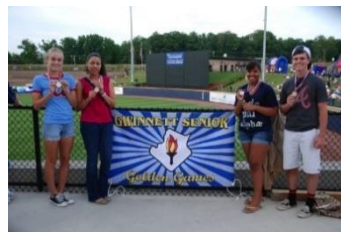
Demo at Gwinnett Braves May 11